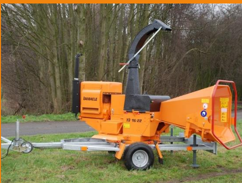
360° revolving (option)