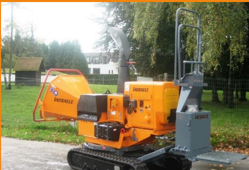
Hydraulic driven on self propelled tracked undercarriage