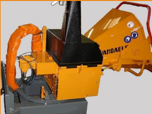
Hydraulic powered version for hydraulic tool carriers